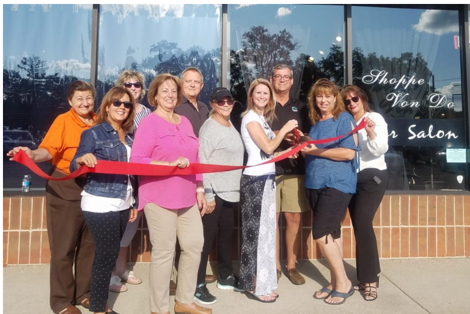
Ribbon Cutting at Shoppe Von Do